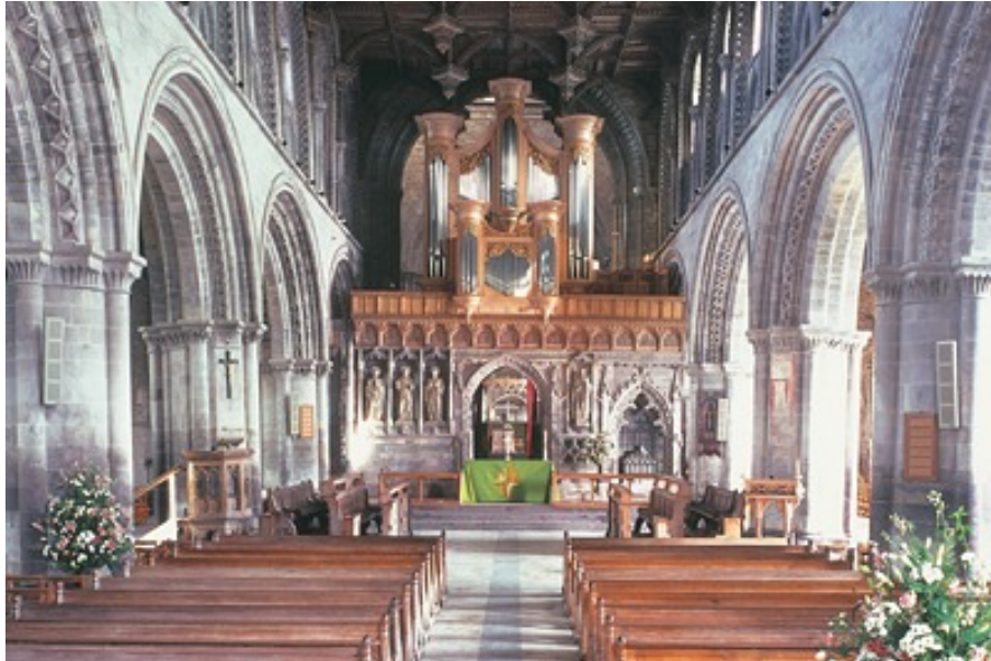
St. David's Cathedral - Pembokeshire