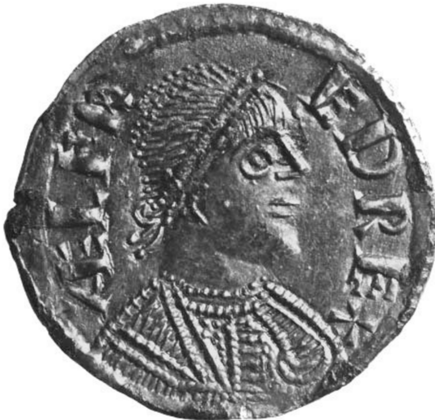
A Coin of King Alfred