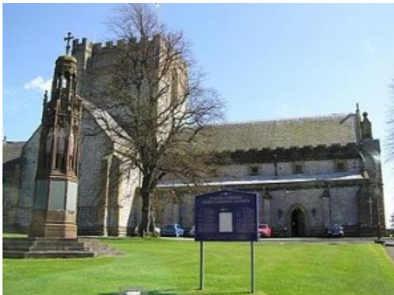
St Asaph Cathedral (site of Monastery) - Welsh: Llandudno

119 Bede, Hist. Eccles. lib. ii. cap. ii.