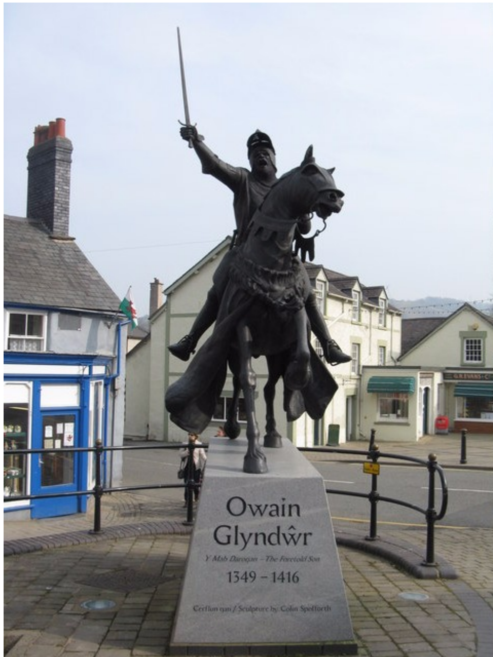
Owain Glyndwr in Corwen

53 Ibid. p. 38. Llywelyn Sion, about 1580, declares that the Bards were really necessitated to resume the Coelbren, as the only possible means of preserving their literature during the oppression of the English, and particularly during the insurrection of Owain Glyndwr, when the government prohibited learning among the Cymry, and denied them the use of paper and other writing materials. Indeed, all the Bards of that age, and long afterwards, constantly allude to the Coelbren, as almost the only means of knowledge.—See p. 1