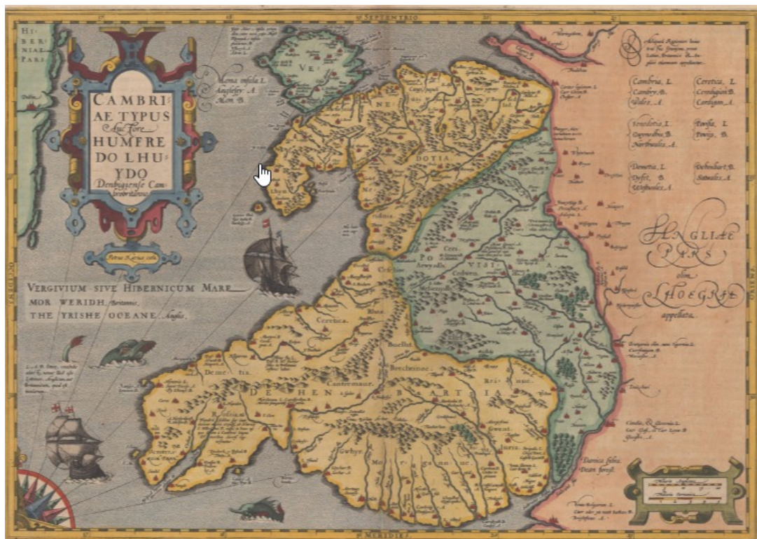
Hand Coloured Map of Wales, Published 1579